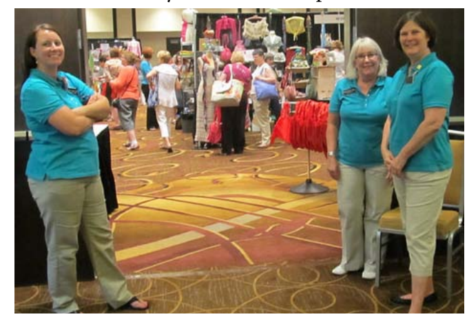
The Show staff welcomes attendees to the Expo.

Photos from the Indianapolis Summer Show are now available to view at TKGA.com/?page= ConferenceHistory. Here's a sneak peek!