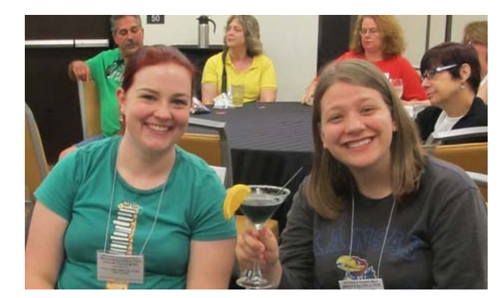
Come for the knitting, stay for the fun!